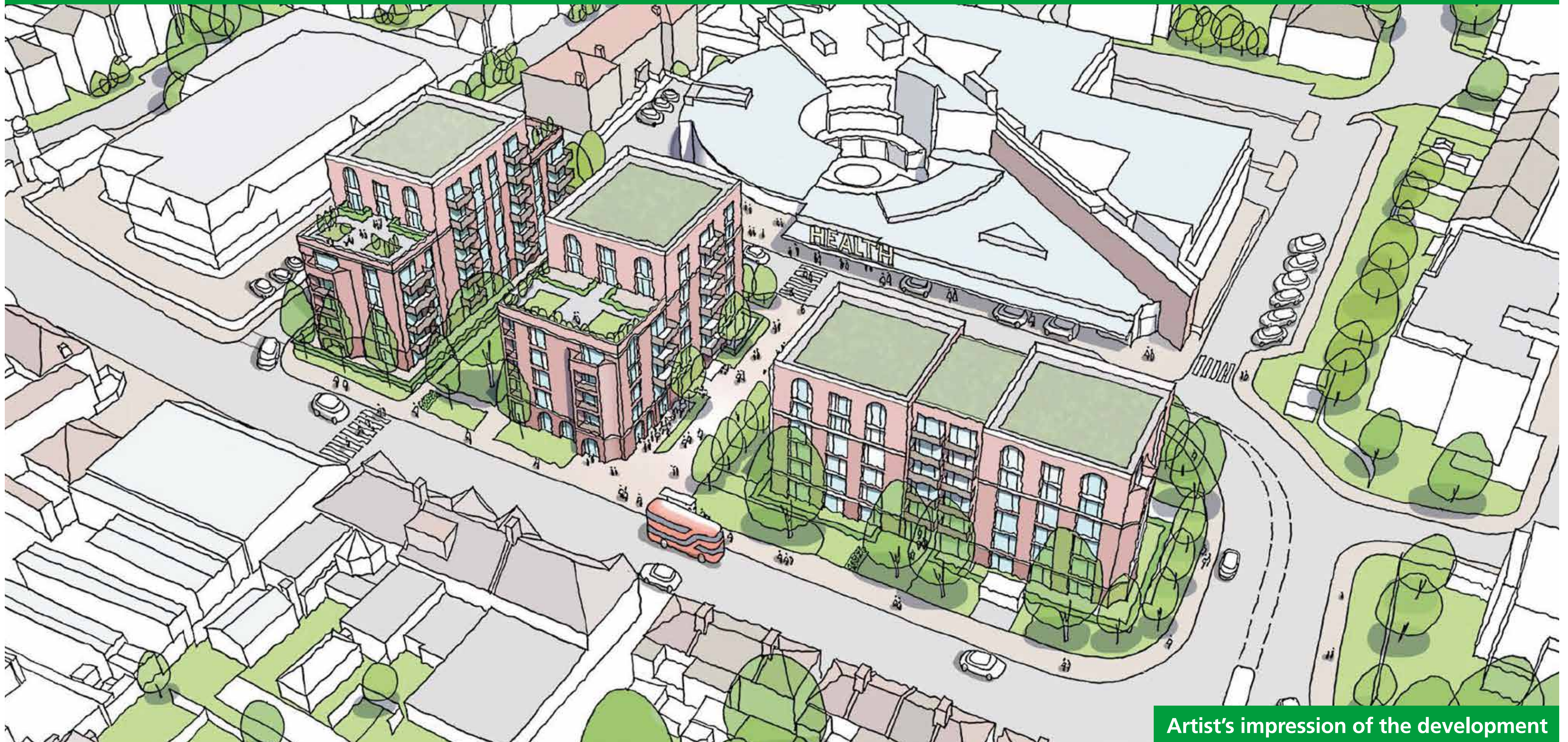
Artist's impression of the development